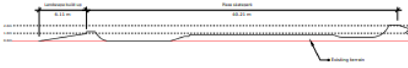
Section A-AA Scale: 1:300